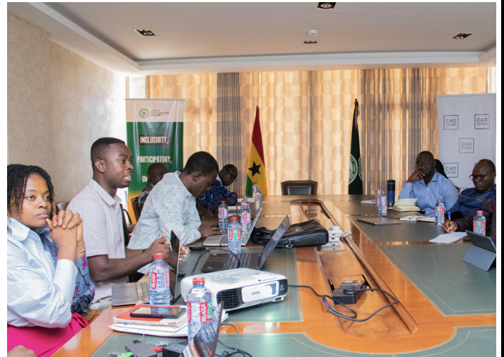
Figure 1: Climate Change Steering Committee meeting conducted in Accra

A quiet revolution has been underway in Accra. Recognizing the urgent need to address climate change, the city launched a pioneering effort to mainstream climate action into its governance . A Climate Change Steering Committee was established, bringing together political and technical leaders to drive climate action. With UCAP CAI support, city staff received training and capacity-building support . A big breakthrough came with the update of Accra's Greenhouse Gas Inventory (GHGI) from 2015 to 2020. As Accra's climate leadership grew, so did its reputation as a hub for climate innovation with the city attracting support from Bloomberg Youth Climate Fund, the Energy Commission of Ghana, and IFC Edge programme . Today, Accra stands as a beacon of climate resilience in West Africa.